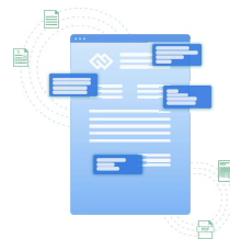
AI OCR eliminates data entry

In order to remain competitive, companies need more than invoice capture and lightweight workflow that have multiple steps to get invoices into the ERP. They need artificial intelligence and machine learning that make their entire accounts payable process nearly touchless, so their finance teams can focus on high-priority and high-value work. The market demand and digital-first, cloud-first mindset have changed the way we think about AP automation; it is important to get solutions into the hands of people who need it, in a way that works best for them.